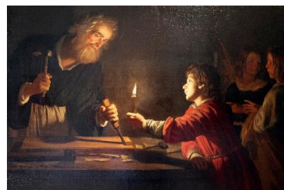
Saint Joseph - March 19

What, then, shall we say in response to these things? If God is for us, who can be against us? He who did not spare his own Son, but gave him up for us all—how will he not also, along with him,