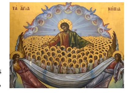
The Holy Innocents - December 28

My spiritual mentor used to say, "The minutes are more important than the years". We keep meaning to find time to draw closer to God, but until we make a deliberate and sustained effort to do so, the time of our lives slips away from us so quickly and so easily. The word 'choked' in this passage is the Greek word 'sumpnigo' and it means to strangle, to drown, to crowd out.