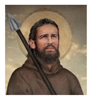
St. Thomas the Apostle, December 21

The seed that fell among thorns stands for those who hear [the Word], but as they go on their way they are choked by life's worries, riches and pleasures, and they do not mature. – Luke 8:14