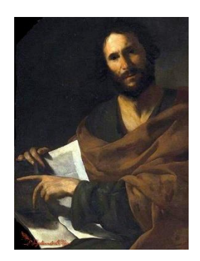
St. John, Apostle and Evangelist - December 27