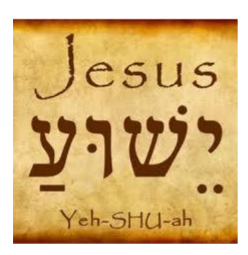
The Holy Name of Jesus - January 1

Sunday, January 7, 2024 - 1<sup>st</sup> Sunday after the Epiphany - Baptism of Our Lord Jesus Christ Holy Eucharist - 10:30am