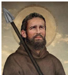
St. Thomas the Apostle, December 21

The seed that fell among thorns stands for those who hear [the Word], but as they go on their way they are choked by life's worries, riches and pleasures, and they do not mature. – Luke 8:14