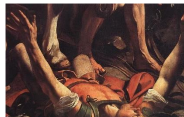
The Conversion of Saint Paul - January 25