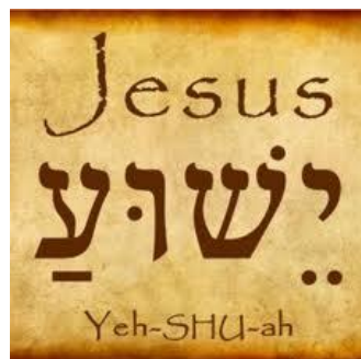
The Holy Name of Jesus - January 1

Sunday, January 28, 2024 - 4 th Sunday after the Epiphany Holy Eucharist - 10:30am