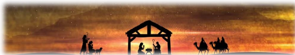
The Nativity of Our Lord Jesus Christ - December 25