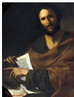
St. John, Apostle and Evangelist - December 27