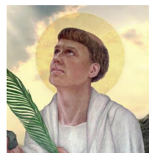
St. Stephen, Deacon and Martyr - December 26

Sunday, January 7, 2024 - 1 st Sunday after the Epiphany - Baptism of Our Lord Jesus Christ Holy Eucharist - 10:30am