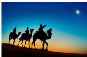
The Epiphany of Our Lord Jesus Christ - January 6

I make room for God when I open myself to the presence of God in all things and in all thoughts.