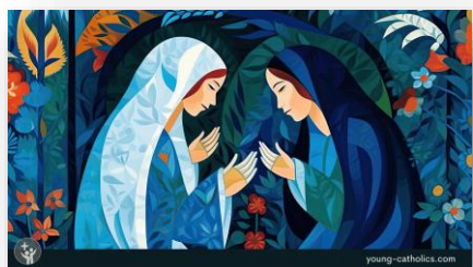
May 31 - The Visitation of the Blessed Virgin Mary