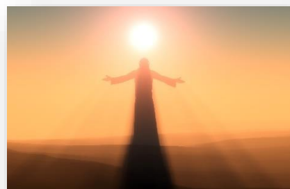
May 9 - Ascension Day

Sunday, May 26, 2024 - Trinity Sunday Holy Eucharist - 10:30am