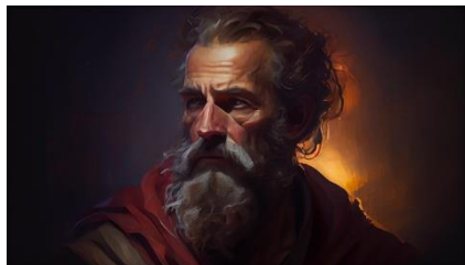
Saint Bartholomew The Apostle - August 24

We don't have a priest who is out of touch with our reality. He's been through weakness and testing, experienced it all—all but the sin. So let's walk right up to him and get what he is so ready to give. Take the mercy, accept the help. – Hebrews 4:15-16