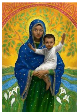
Saint Mary the Virgin, Mother of Our Lord Jesus Christ, August 15

In August, we celebrate the feast of Saint Mary the Virgin, Mother of Our Lord Jesus Christ. It seems fitting to take a close look at a couple of words that Mary uses in her hymn of praise to God, known as the Magnificat.