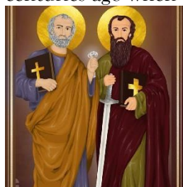
The Apostles Saint Peter and Saint

The bulletin for Evening Prayer and Confirmation the following Sunday, Whitsunday or Pentecost included this great description. “Pentecost, commonly called Whitsunday, was the day on which our Lord fulfilled his promise to the disciples by sending them the Comforter. The word ‘comfort’ suggests something soft and soothing to most of us, but this was not the case five centuries ago when the Bible began to be translated into English. The ‘Comforter’ both by