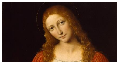
Saint Mary Magdalene - July 22