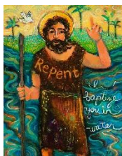
The Nativity of Saint John the Baptist - June 24

At the time of this writing for the June/July Chronicle, our spring Ingathering hasn't happened yet. It will be this Sunday May 21st so the report on the thank-offering won't be made until later. There will be a fall thank offering as well. However, be sure to pick up a little blue box and keep it handy at home, giving thanks and putting in coins and bills in thanksgiving for all the blessings you receive.