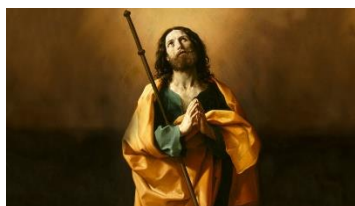
St. James the Apostle - July 25