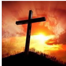
Holy Cross Day - September 14