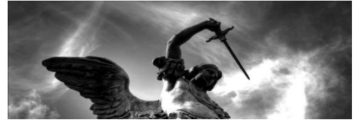
St. Michael and All Angels - September 29