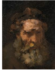
St. Matthew, Apostle and Evangelist, September 21