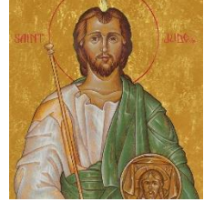
St. Jude, Apostle, October 28

Far too often, you might hesitate to inform me of your desire/need for pastoral care, because you do not want to bother me. On the contrary, you are not bothering me when you inform me of a major illness, yours or a loved one's illness. Because of privacy issues and regulations, staff at hospitals, nursing homes, and other health care facilities will not contact me. You, a family member, or a close friend must contact me, if you have a pastoral need.