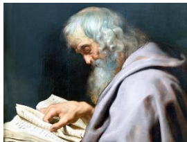
St. Simon, Apostle, October 28

Last November, I injured my right hand while asleep in the chair at the desk. The emergency room doctors diagnosed radial nerve palsy. I would need to wear a brace and undergo occupational therapy. Though not prescribed, prayer was essential and vital to the healing process. I prayed, and so did many others for my healing. I followed the occupational therapists’ instructions: exercises twice a day at home. My longtime primary care physician said it might take four months for me to use my hand as I had used in the recent past. Within three months, my hand had healed. Thanks be to God.