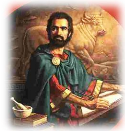
St. Luke, the Beloved Physician and